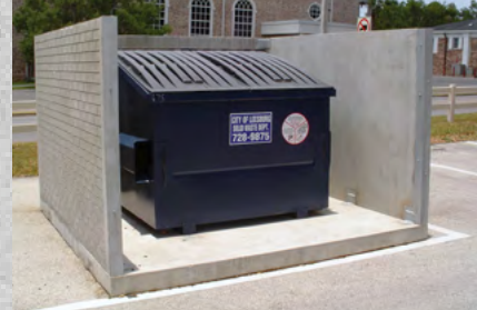
Pre-Engineered • Minimal Site Preparation • Delivered To Site Ready To Use • Maintenance Free • Durable • Sustainable

MANUFACTURED throughout the USA & Canada by Licensed Producers. AVAILABLE LOCALLY FROM: