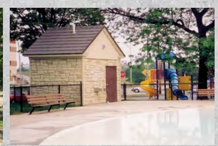
And other useful Precast Concrete Products • Sound & Privacy Walls • Saftey Barriers • Planters • Dumpster Enclosures