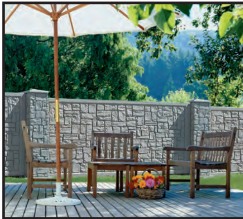
Verti-Crete Engineered Precast Concrete Panels & Columns

Design flexibility provides compatibility with a variety of architectural styles. The columns can be incorporated with other fencing materials such as vinyl and wrought iron. Other applications include decorative mailboxes, street lighting bases, signage and monuments.